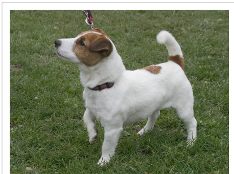
Glatthaarig und weiß-braun

Als ideale Widerristhöhe wird im Standard 25 bis 30 Zentimeter angegeben. Ein 25 Zentimeter großer Hund soll um die 5 Kilogramm wiegen und ein 30 Zentimeter großer Hund etwa 6 Kilogramm. Er ist insgesamt länger als hoch. Der Umfang des Brustkorbs unmittelbar hinter den Ellenbogen sollte ca. 40 bis 43 Zentimeter betragen. Er ist überwiegend weiß mit Abzeichen in schwarz, braun oder lohfarben (engl. Tan) bzw. jeder Kombination dieser Farben. Das Fell ist glatt-, rau- oder stichelhaarig (engl. broken coated). Die V-förmigen Ohren sind nach unten geklappt. Die Rute darf in der Ruhe herabhängen, sollte in der Bewegung aufrecht getragen werden. Bei Verwendung als Jagdgebrauchshund ist das Kupieren der Rute in Deutschland laut Tierschutzgesetz erlaubt.